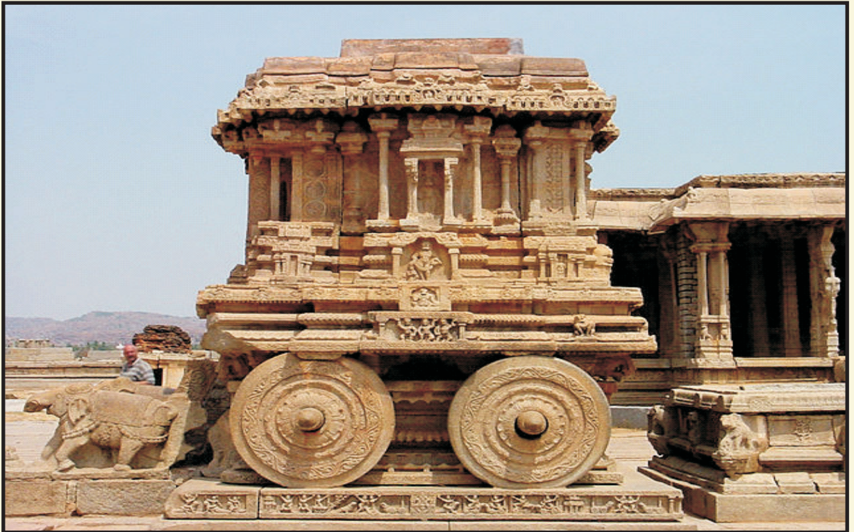
Stone chariot, 16th century, Vitthala Temple, Vijayanagar empire, Hampi